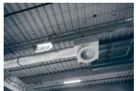
Car Park Ventilation System & Jet Fans