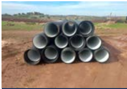
Primary Side Piping with welded ball valves