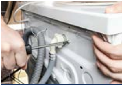
Waste Water Drainage