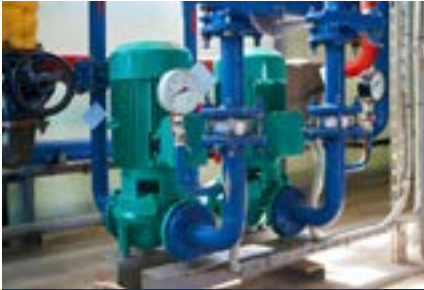
Primary – Secondary CHW Pumping