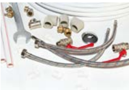
Filed joint kit & Leak Detection System