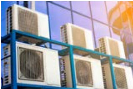
Central Cooling Plants Air Cooled Chillers