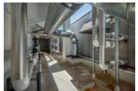
Air Cooled Chillers