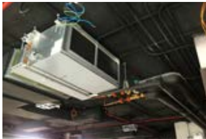
AHU/FCU and Heat Recovery Units