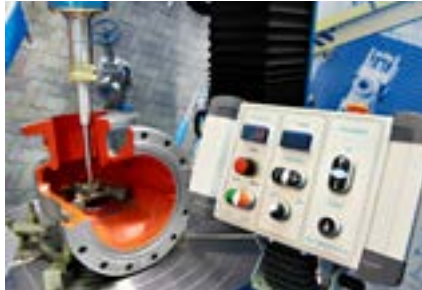
VFD Pump Control Panels