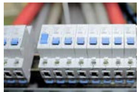
PLC Panel & Energy Monitoring