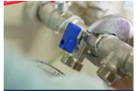
Soil & Waste Drainage