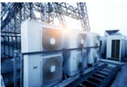
Air-Conditioning Refrigeration Systems