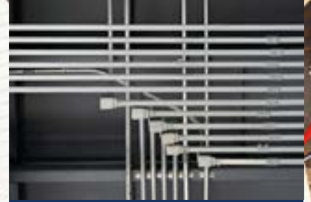
Busbar Riser System