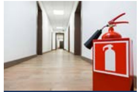
Foam Suppression System