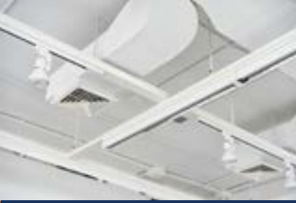
Power distribution & Lighting Systems