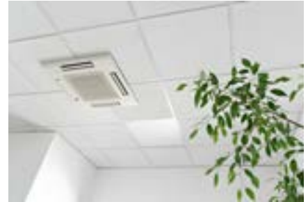
Indoor Air Quality (IAQ) & Air Treatment