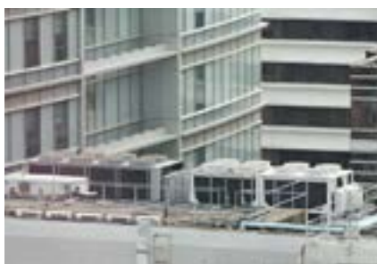
Atrium Smoke Ventilation