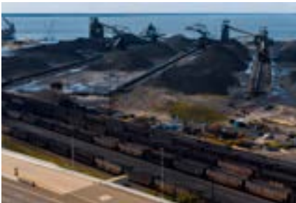
Energy Transfer Stations (ETS)