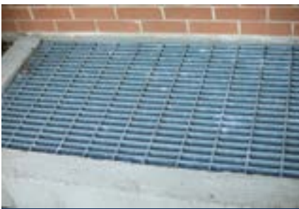
Storm Water Drainage