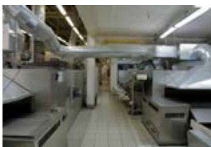
Commercial Kitchen Ventilation (CKV)