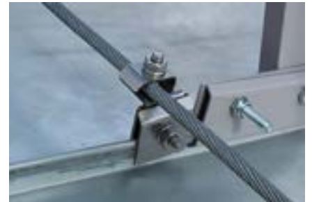
Earthing & Lightning Protection System