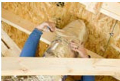
HVAC Duct Work, Insulation