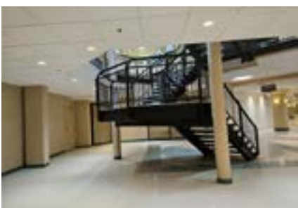
Staircase & Smoke Stop Lobby Pressurization