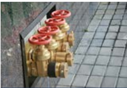
Hose Reel, Standpipe and Hydrants FM