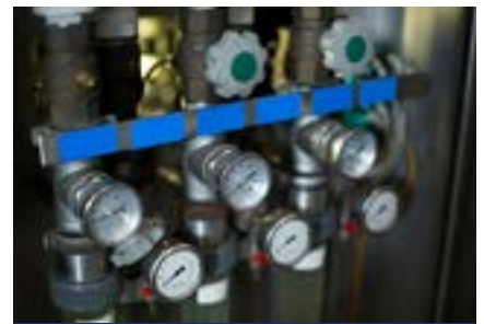
Stationary Fire Pumps as per NFPA 20