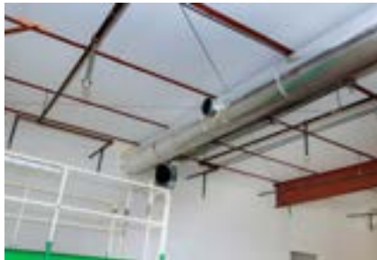
CHW Piping, Insulation and Cladding