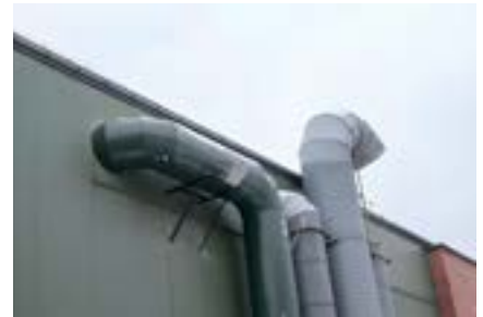
Fire Rated Ducting