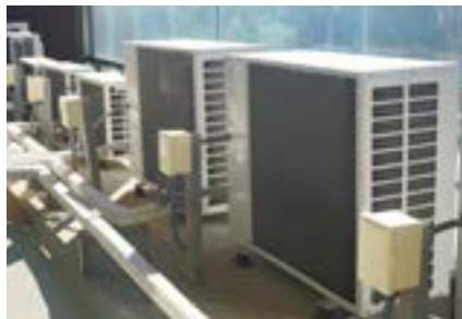
Packaged AC Units