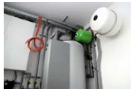
Domestic Water Treatment System