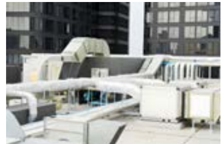
Treated Fresh Air Handling Units