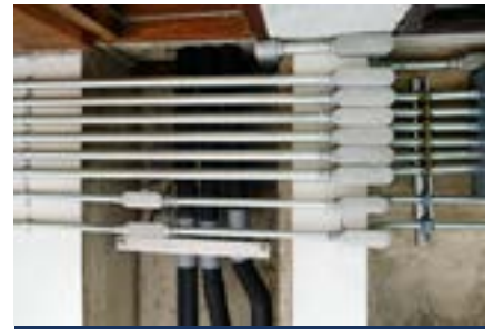
Underground Pre-insulated piping