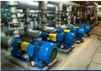
Energy Transfer Stations (ETS)