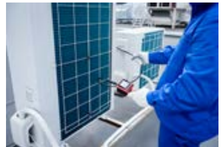
Precision Air Conditioning Systems