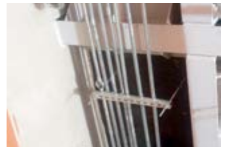
GI Conduit Pipe