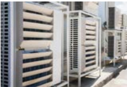
Split AC Units & VRF Systems