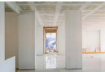
Industrial & Building Lighting installations