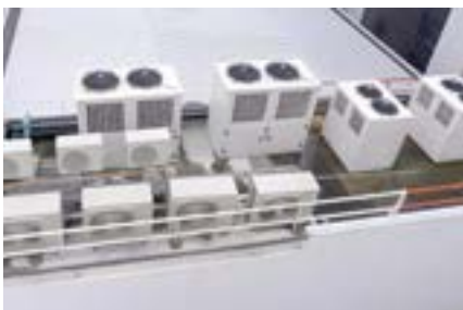
Heat Recovery Ventilation Units