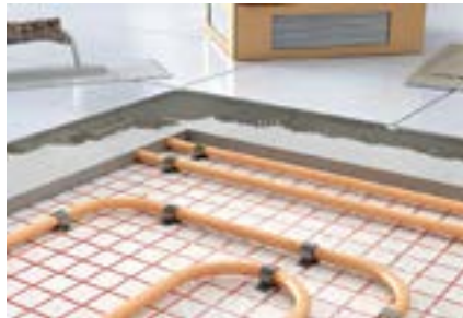
Raised Floor/ Under- floor systems