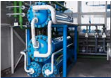
Cold & Water Supply