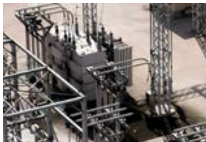
Transformers, Substa- tion & External Works