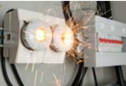
Power Cabling & Con- tainments