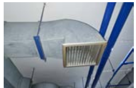
Kitchen & Smoke Ventilation