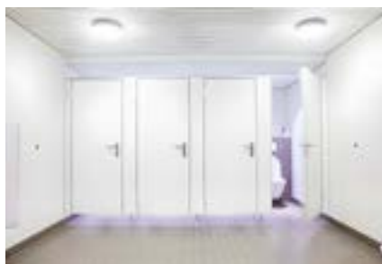
Cold Rooms & Display Units